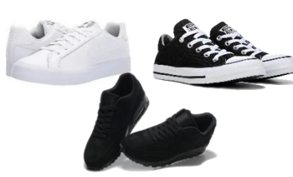
Solid black, solid white or a black/white combo athletic shoes/laces/soles – No other colors allowed