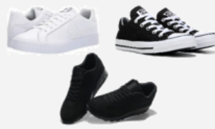
Solid black, solid white or a black/white combo athletic shoes/laces/soles - No other colors allowed