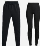
Solid black pants, jeans, or shorts that cover the knee