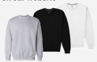
Solid crewneck in white/black/gray may be worn over collared shirt