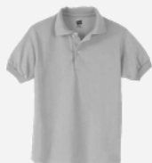
Solid gray polo shirt with collar, long or short sleeved - worn at all times