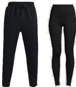
Solid black pants, jeans, or shorts that cover the knee