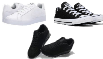
Solid black, solid white or a black/white combo athletic shoes/laces/soles – No other colors allowed