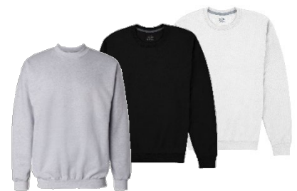
Solid crewneck in white/black/gray may be worn over collared shirt