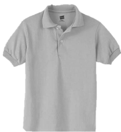
Solid gray polo shirt with collar, long or short sleeved – worn at all times