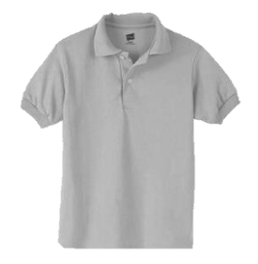
Solid gray polo shirt with collar, long or short sleeved – worn at all times (NO LOGO)