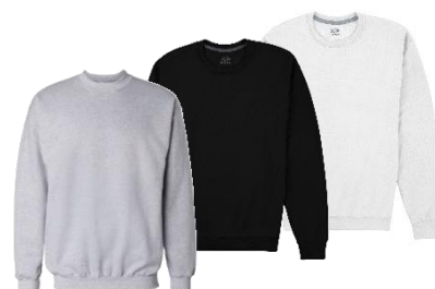
Solid crewneck in white/black/gray may be worn over collared shirt