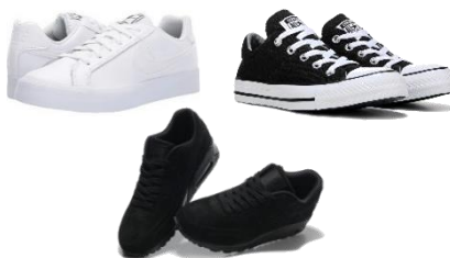
Solid black, solid white or a black/white combo athletic shoes/laces/soles – No other colors allowed